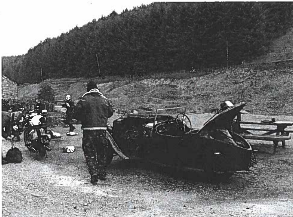
It looks like a car but this BSA three wheel vehicle is classed as a motor cycle as it has no reverse gear.

The trial is based on the route of the Travers Trophy Trial first held in the 1920's and is open to motor cycles over 25 years of age, the oldest in this year's trial being being a 1925 Triumph. Whilst Killhope was not included as a checkpoint in the original 1920's route it has been a popular stage since the trial was resurrected in 1998.