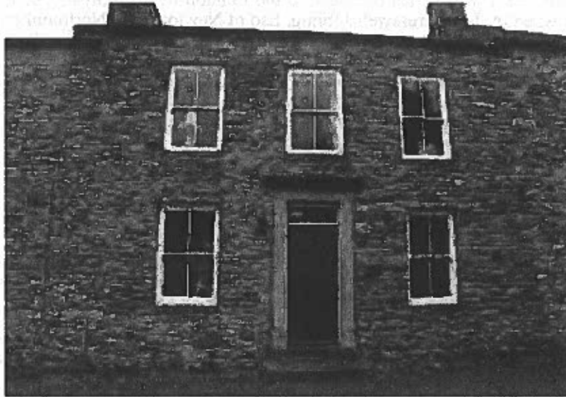
Digging for clues: Beautifully crafted mahogany sample drawers at Gilmore House, in Alston, suggest the property may once have been the home of a geologist employed at the local mines, or a keen amateur mineral collector.

Living in The Butts is no joke in Alston — rather it is a matter of pride.