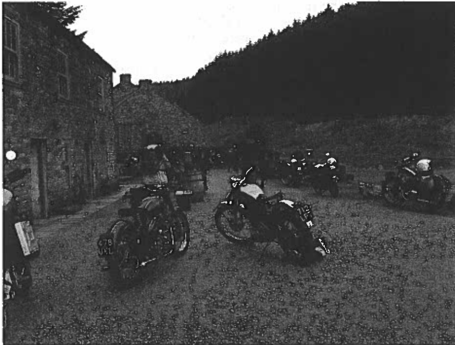
Riders and bikes enjoy a welcome rest

The bikes began to arrive at Killhope just before 10.00am and all but one were through the checkpoint by 11.20am. One entrant arrived at 12.30pm having had to visit Barnard Castle to replenish his fuel tank. Some motor cycles have a limited range and the closure of the filling station at Westgate has caused problems for the organisers. The stop at Killhope allowed many of the riders, and one driver of a BSA three wheeler, to take a break and they and their machines were a popular attraction for both the staff and visitors at the museum.