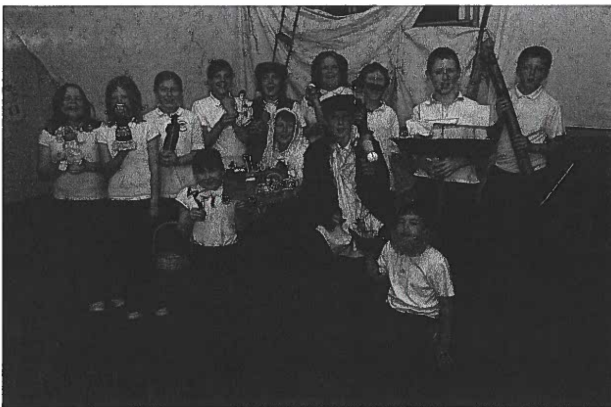
St John's Chapel Primary School, re-enact a journey to New Zealand on the Margaret Galbraith in 1879.